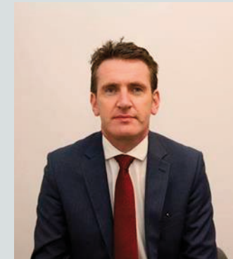
Aodhán Ó Ríordáin TD Labour Party