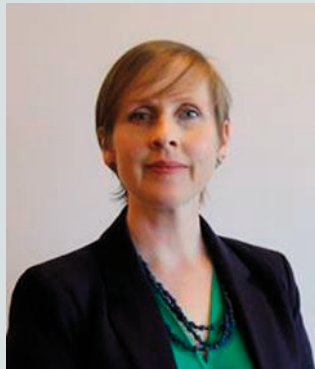
Senator Pauline O'Reilly Green Party