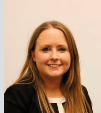
Mairéad Farrell TD Sinn Féin