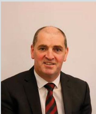
Paul Kehoe TD Fine Gael (Cathaoirleach)