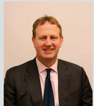
Jim O'Callaghan TD Fianna Fáil