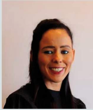
Senator Eileen Flynn Independent