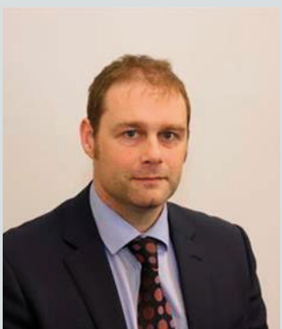
Marc Ó Cathasaigh TD Green Party