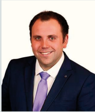
Cathal Crowe TD Fianna Fáil