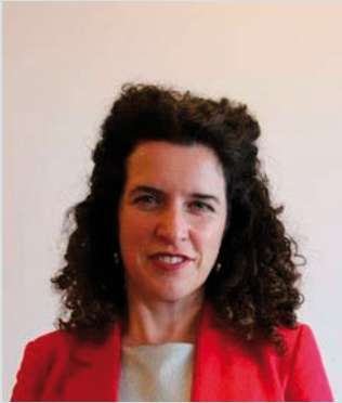
Senator Aisling Dolan Fine Gael