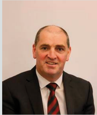
Paul Kehoe TD Fine Gael ( Cathaoirleach )