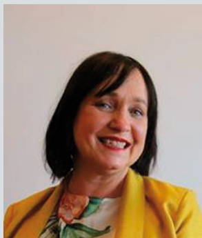
Senator Fiona O' Loughlin Fianna Fáil (Leas- Cathaoirleach)